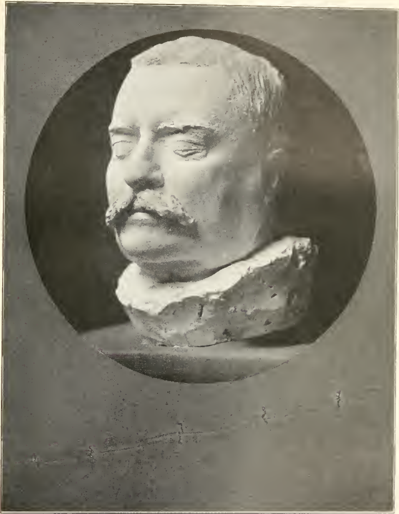
THEODORE ROOSEVELT—DEATH MASK, 1919